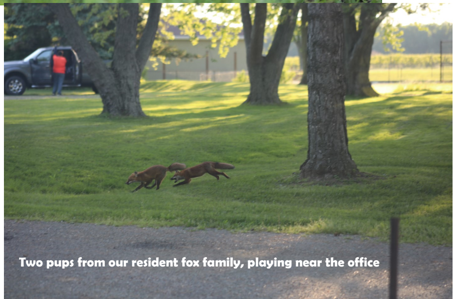
Two pups from our resident fox family, playing near the office