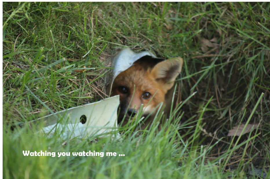
Watching you watching me ...